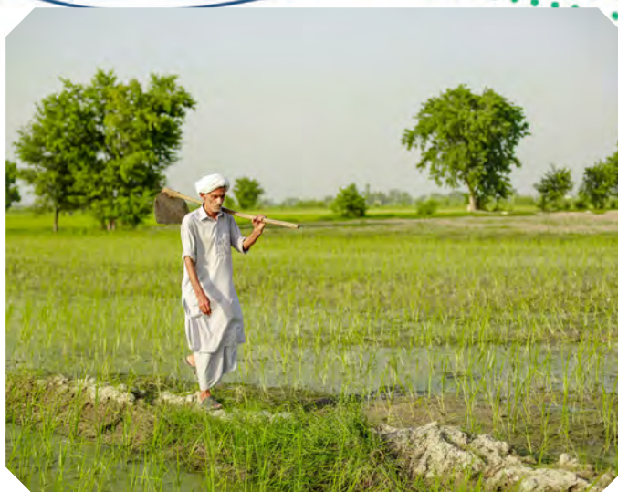
Figure 2 Having Water Accounting standards can benefit farmers

Ministry of Water Resources, Ministry of National Food Security & Research, Federal Flood Commission, Pakistan Council of Research in Water Resources, provincial departments from Punjab, Sindh, Balochistan, and Khyber Pakhtunkhwa [Irrigation and On Farm Water Management], academia, and other industry experts.