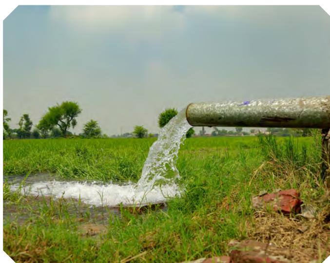
Figure 3 Excessive groundwater pumping for agricultural purposes has reduced groundwater levels in many parts of Punjab