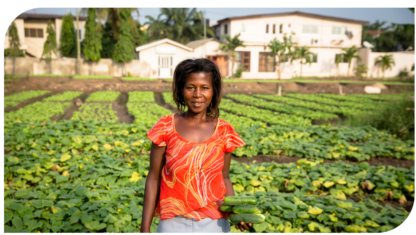
Cucumber farmer in Ghana, Nile Basin

In the upcoming Global Landscapes Forum (GLF) Alan Nicol will be leading a youth initiative on landscape restoration, which will ask young innovators to build on the 4BGP project and define tools for socio-economic and environmental data development and use in order to enhance vital land restoration processes in the Nile and Volta. The results of this session will be considered in the future development of the project.