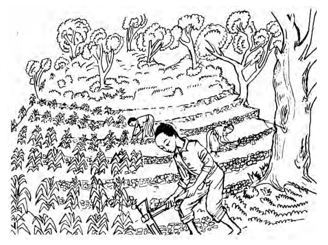
Fig. 1a. Conservation agriculture is an option to improve land and water productivity in Tanzania.

Conservation agriculture is any system or practice that aims to conserve soil and water by using minimum soil disturbance (conservation tillage) and crop rotation/association to minimize soil evaporation, which reduces runoff and erosion and improves conditions for plant establishment and growth. It involves planting crops and pastures directly into land, which is protected by mulch using minimum or no-tillage techniques. It is also used to increase organic matter content by improving soil structure and fertility, reduce reliance on cultivation, and achieve viable and sustainable productivity (Fig. 1a).