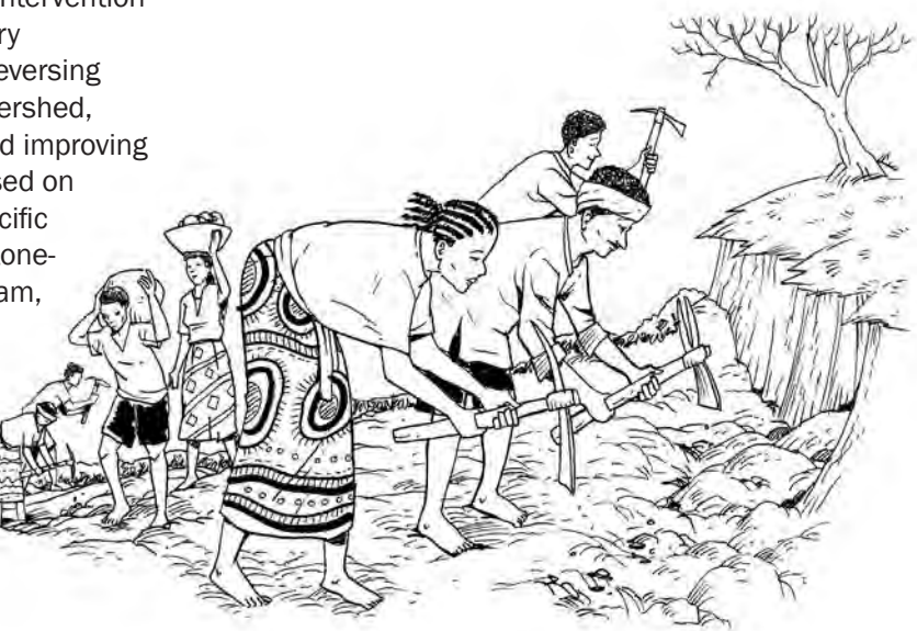
Fig. 1. Community members participate in soil and water conservation activities.

The study compared soil loss rate from treated and untreated watersheds. Eight soil samples were collected during the transect walk using systematic random sampling, combined to form a composite sample. This was done across three slope ranges (upper, middle, and lower) and across three locations in each of the four sub-watersheds. The soil samples collected and analyzed totaled 36.