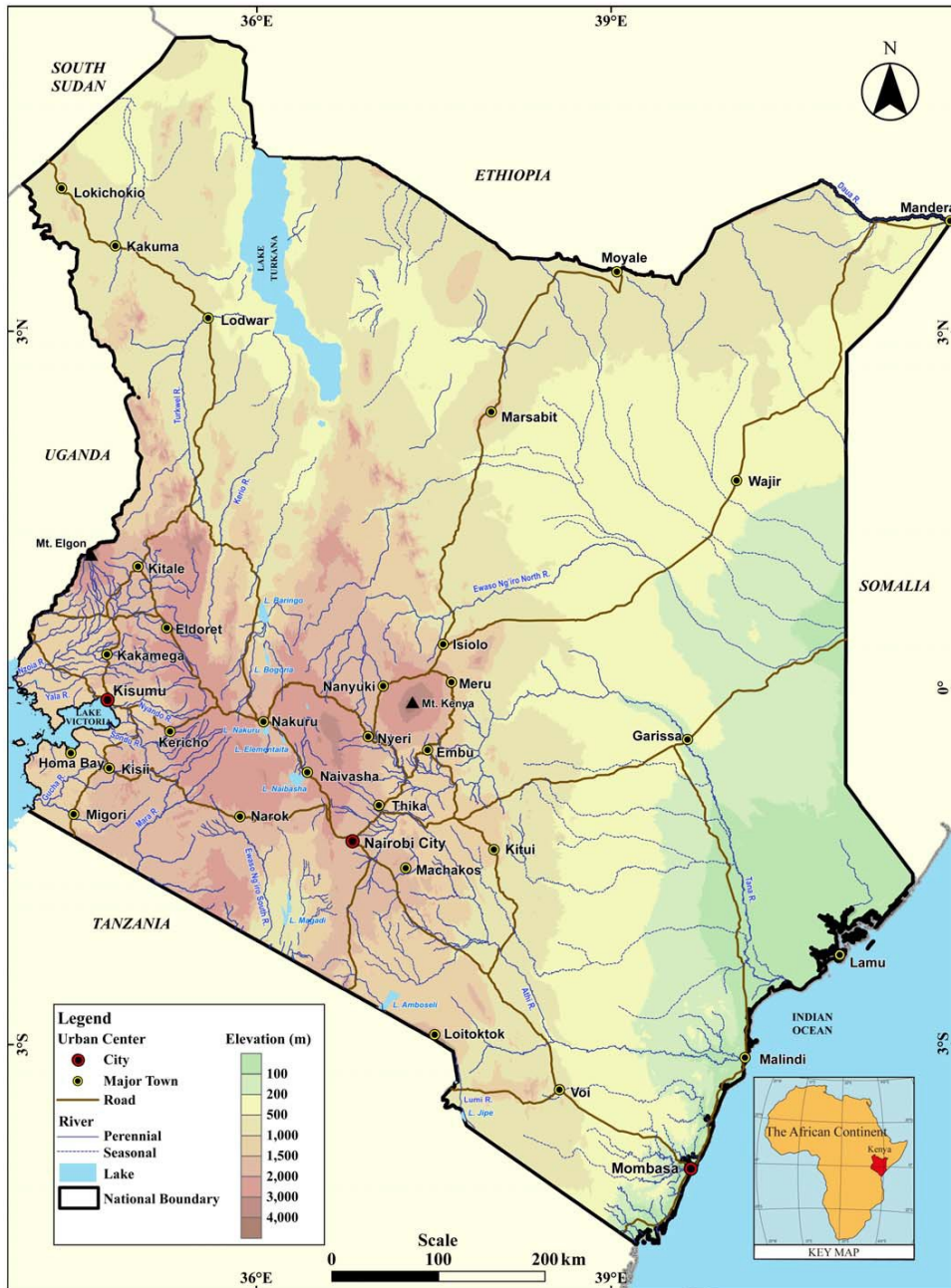
Figure 1: Kenya: Extent, topography and major towns (Source: Republic of Kenya, 2013).

in 1997 to 38.7 % in 2020 (UNDP, 2020). Kenya ranks 143 out of 189 countries and territories on UNDP Human Development Index (UNDP, 2020).