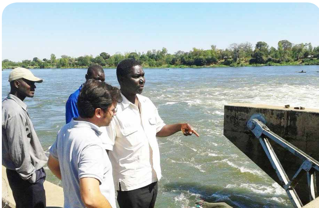
FIGURE 3. Kamuzu Barrage, Shire River, Malawi. The height of the Kamuzu barrage is currently being augmented to allow for greater water control.

establishment of a joint committee that serves as a platform for data exchange and research on the issues of flooding, aquatic weed management and rules for navigation. Second, a collaboration-oriented form of cooperation is focused on adopting joint flood and weed monitoring practices, and possibly an agreement on a joint taxation and maintenance program for navigation. Finally, a third, action-oriented form of cooperation would center on the construction, operation and maintenance of joint infrastructure work.