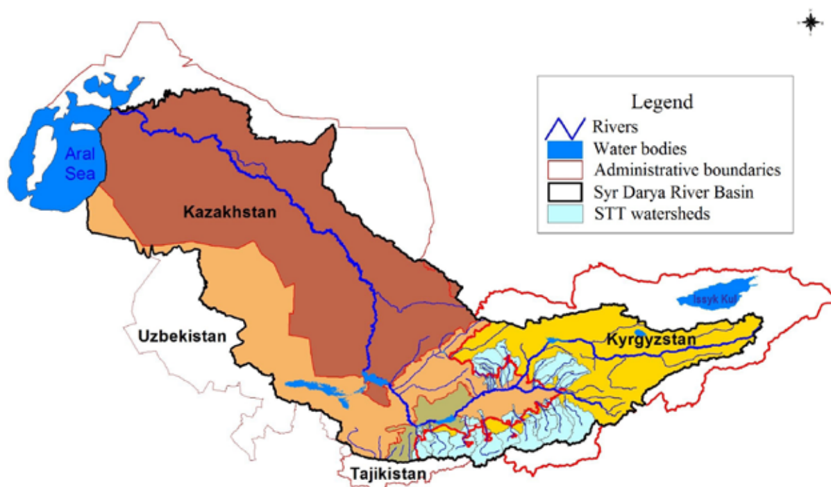
FIGURE 1. Syr Darya River Basin and its small transboundary tributaries.

Small transboundary tributaries (STTs) in the Syr Darya River Basin. One of the two main rivers in the Aral Sea Basin, the Syr Darya, and its associated watershed are 219,000 km 2 in size, generate an annual flow of 37 km 3 and are shared by four Central Asian republics: Kyrgyzstan, Tajikistan, Uzbekistan and Kazakhstan (Figure 1). The Syr Darya watershed contains an abundance