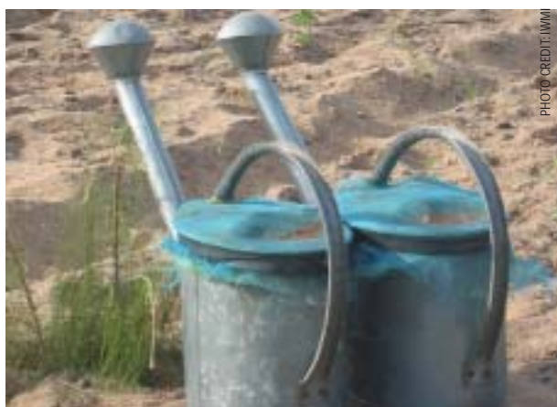
Simple modifications have the highest chance of adoption

An important option for complementary risk reduction is vegetable washing and disinfecting at home and at food outlets, which is common practice in developed and developing countries. Well-designed awareness programs can have a significant impact on safeguarding public health where treatment technologies cannot be put in place. It does not require large financial