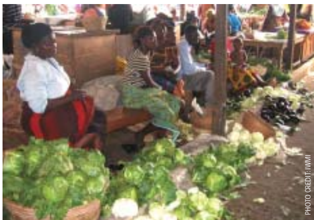
The possibility of post-harvest contamination requires attention

and as a reliable supply. In all these cases, cash crop production provides tremendous livelihood opportunities. In Pakistan, for example, wastewater farmers typically earn 30-40 percent more per year than farmers using conventional irrigation water, while in Ghana, dry-season irrigation with wastewater allows an average extra income of 40-50 percent. Around Kumasi more than 60,000 people depend on these sources for their living while in the Mezquital Valley in Mexico, the area irrigated with wastewater supports more than 450,000 people.