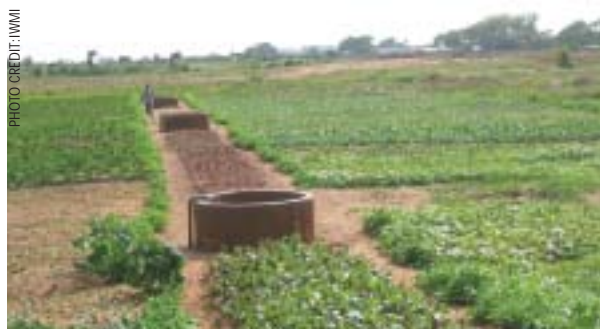
Intermediate water storage supports pathogen die-off

Secure land tenure encourages farmers to invest in mitigation measures at the farm level. A majority of urban and peri-urban farmers in many countries occupy/squat on public lands or are tenants on land owned by others and have no tenure security. Where policy reforms can provide greater (formal or informal) tenure security, farmers are more likely to invest labour and capital in irrigation infrastructure, such as drip or furrow irrigation, which reduce crop contact with wastewater. Improved tenure contracts would allow for such investments, while credit