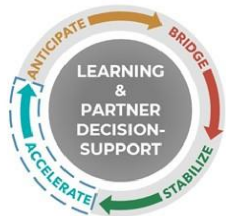
Four original FCM initiative work packages