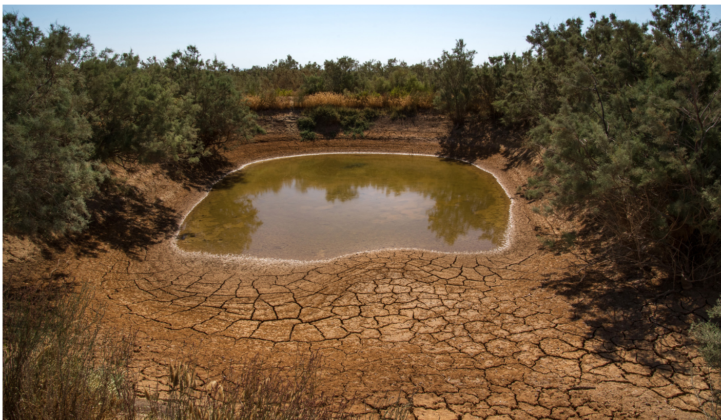
Drying water pond in Jordan, July 2020.

The CWANA region, which spans a vast area across Central and West Asia and North Africa including all countries covered by the United Nations Economic and Social Commission for