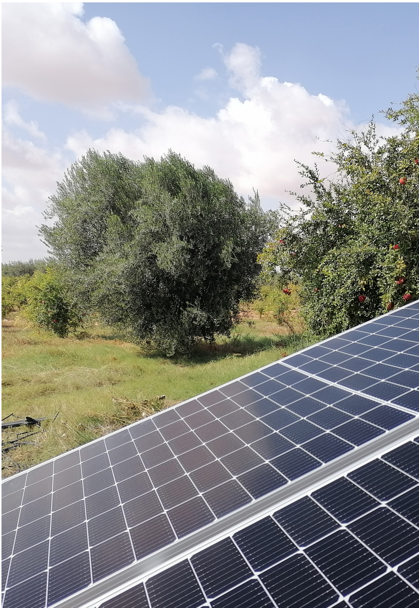
Solar panels at a farm in Chorbane, Mahdia, Tunisia, October 2021.