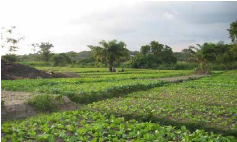
FIGURE 7.1. Typical irrigated urban vegetable farming system in Kumasi.

In Kumasi , larger areas under informal irrigation can be found in the inland valleys passing the city where shallow wells, dugouts and polluted streams are the main sources of irrigation water (Figure 7.1). About 70% of farmers interviewed use polluted streams. None of the farmers interviewed used untreated wastewater or effluents directly from treatment plants. Very few cases ( n < 5 ) were reported where farmers, because they have no choice, use wastewater from drains. There is extensive use of shallow dug wells on valley bottoms (27%), especially in the urban area. Of the 70 farmers interviewed, more than 75% said that they use the source of water that is accessible and reliable. Piped water is not only expensive but also often not flowing, if there is an access point close to the fields which is seldom.