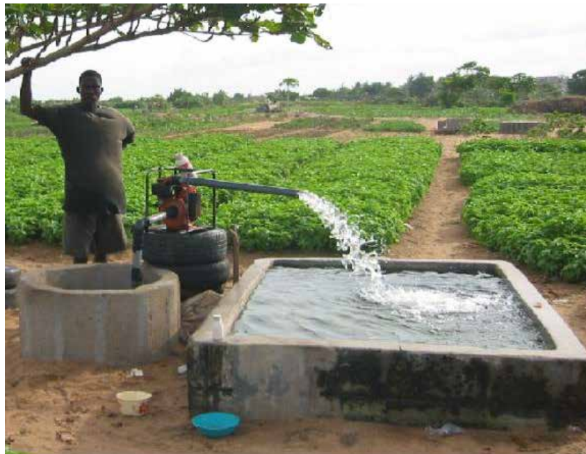
FIGURE 7.5. Watering can irrigation with well, pump and storage reservoirs in Togo. Other reservoirs are visible in the background.

technologies. Farmers in Lomé have access to larger plots, and the city authorities accept them (Figure 7.5). In many cases, tenure agreements exist. This security favors investments, for example, in tube-wells to access safe water and multiple storage ponds, i.e. conveyance-saving technologies, which are necessary to maximize the profits from larger plots.