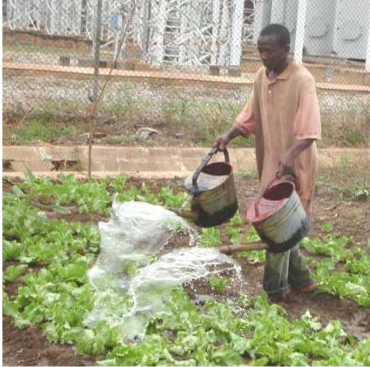
FIGURE 7.2. Lettuce irrigation with watering cans in Accra.