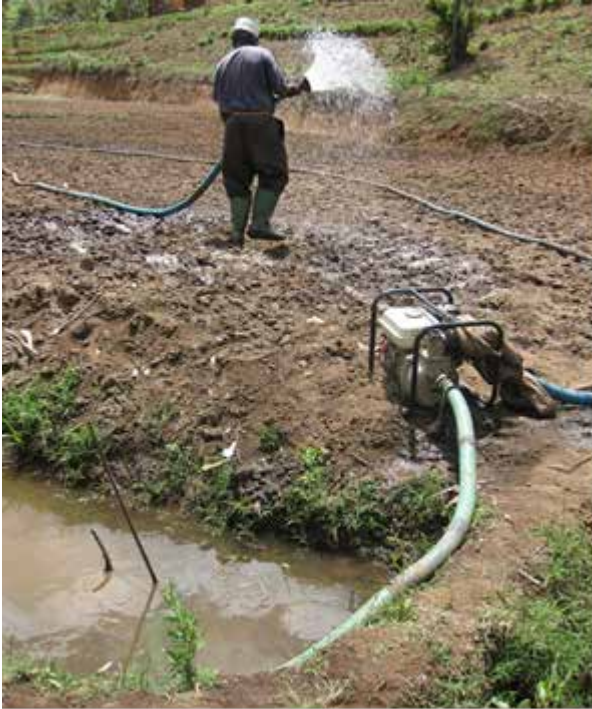
FIGURE 7.3. Farmer using a small motorized pump irrigating from an on-farm pond.

Pumps are not fixed in the fields but taken home over night. In the field, they are placed near a water source, usually the bank of a stream or near a shallow well and water is pumped through rigid plastic pipes or semi-flexible pipes which are connected to a flexible hosepipe at the end. Farmers use the hose pipe to apply water to their crops either overhead or near the roots on the surface, depending on the crop. In other cases, pumps are only used to lift water from a deep water source and pump it to a water reservoir or pond in the farm, from where irrigation is done using watering cans.