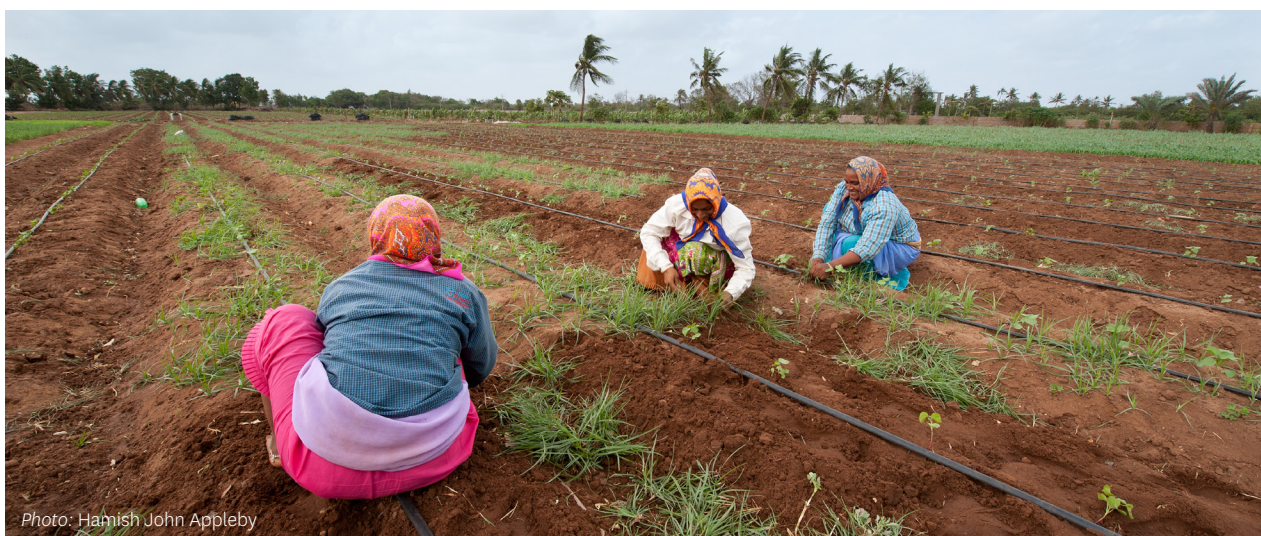
A farm using drip irrigation