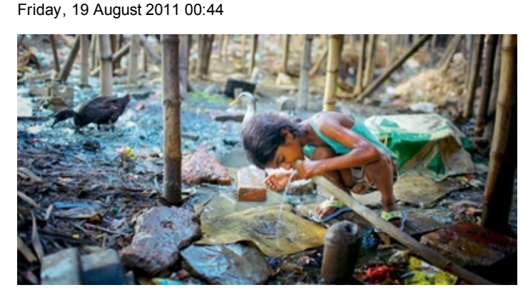
winner of 2011 WIN photo competition. All finalist photos are on display at the venue at the WIN exhibition booth and can be found online at www.waterintegritynetwork.net.