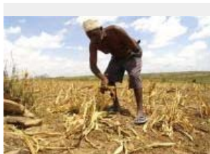
1 of 1 Full Size

The world's population is forecast to rise to over 9 billion by 2050 from its current 6.9 billion, putting more strain on resources.