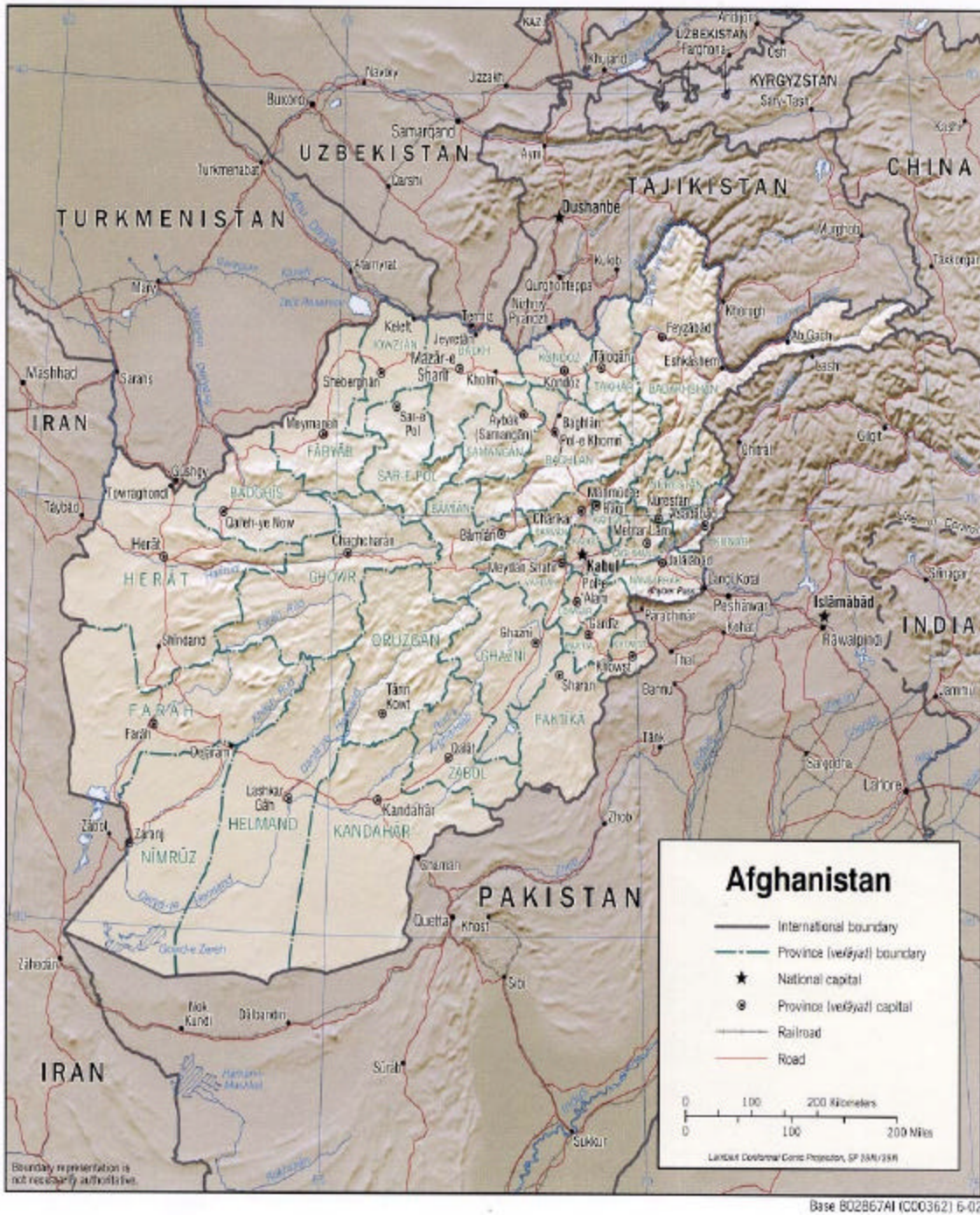
Figure 1. Map of Afghanistan showing its location in the region