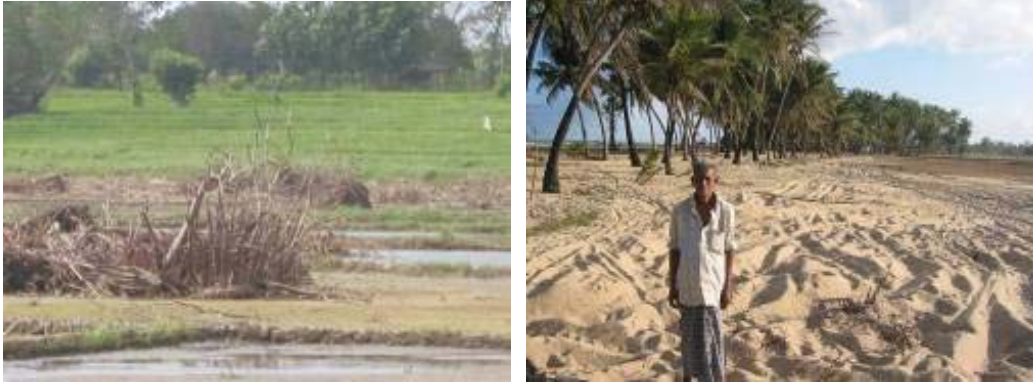
Debris (left) in many and sand in fields close to the ocean (right) were left in farmers rice fields.