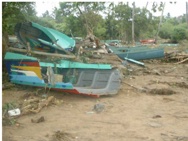
One-day mechanized boats on Kalametiya beach

Details of loss or damage to boats and equipment (see tables 2, 3 and 4) were obtained through an initial rapid survey, followed by household surveys and group discussions to verify the data. This investigation was carried out in January 2005 by members of the villages concerned who had assisted Sonali Senaratna Sellamuttu in compiling socio-economic data for her PhD 7 research over the past three years. Over this period, these community members underwent training in participatory research techniques for socio-economic data collection. This training, together with their in-depth knowledge of each family in their respective villages provided the necessary basis for eliciting accurate information