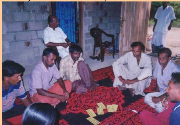
FGD with sea fishers who use oruwas