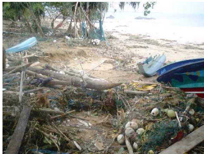
Broken Oruwas (traditional boats) and damaged nets on Kalametiya beach

The results indicate significant loss of the smaller boats and of nets across the board. This is as expected since the boats and nets are usually left on the beach or in a small enclosure nearby, and are thus the most exposed. Outboard motors, on the other hand, are generally taken home, and the low numbers impacted reflect this practice. Preliminary discussions held in January 2005 with the affected individuals and their families also indicate that the vast majority of affected fishermen are keen to resume their fishing activities, if they are provided with a means of replacing or repairing boats and equipment.