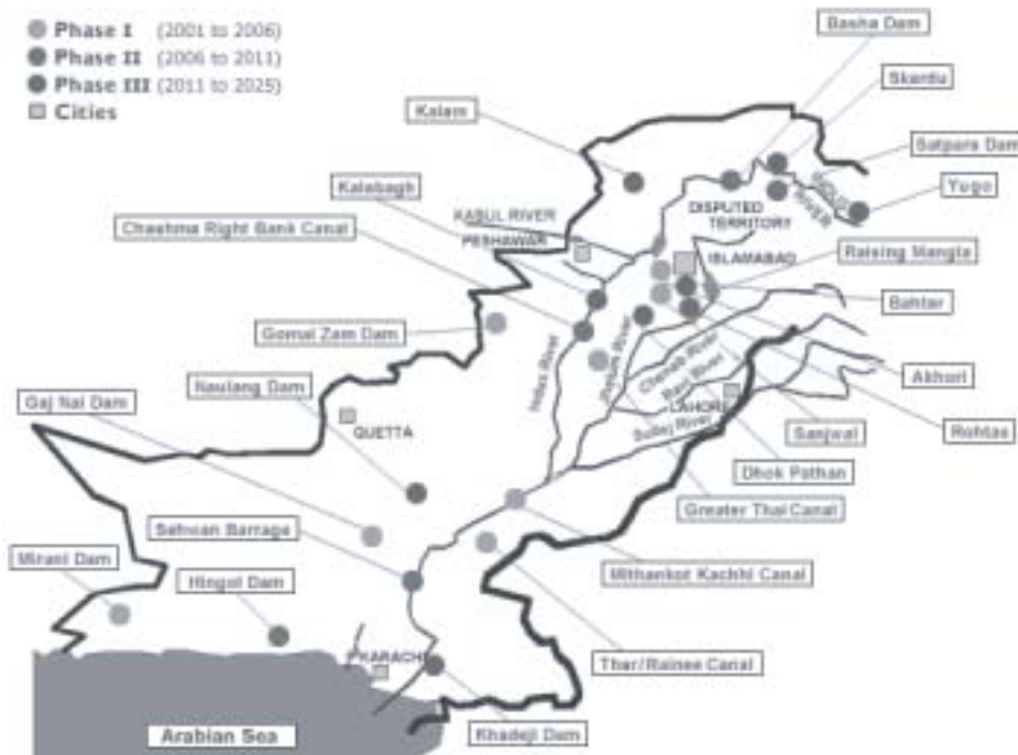
Figure 3. Location map of the water development projects envisaged under Vision 2025.

Overall, in Pakistan, drought management should be part of the larger national water-development strategies and plans. WAPDA’s comprehensive program of Water Resources and Hydropower Development has been designed to avert the impacts of droughts and desertification in the country on a longer-term basis by augmenting the existing canal-water supplies. The projects included in the Vision along with the site locations are presented in figure 3. The projects of Vision 2025 have been included in the Perspective Development Plan for the period 2001–2011. Work on several projects (Mangla Dam Raising, Raineer, Katchi and Greater Thal Canals) has already started. All the three mentioned canals will provide water to drought-prone areas (WAPDA 1987, 2001).