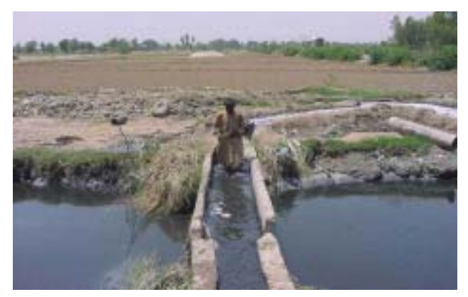
A farmer wades through a homemade diversion canal, which carries wastewater to his fields, Pakistan

Health education, both for farmers and the public at large, can help minimize the health risks associated with wastewater irrigation. Farmers should be made aware of all the potential risks they face. They would also benefit from a knowledge of the basic hygienerelated precautions they could take to avoid infection and prevent the spread of gastro-intestinal diseases to their families. Because the communities of wastewater farmers studied in Pakistan were small and localized