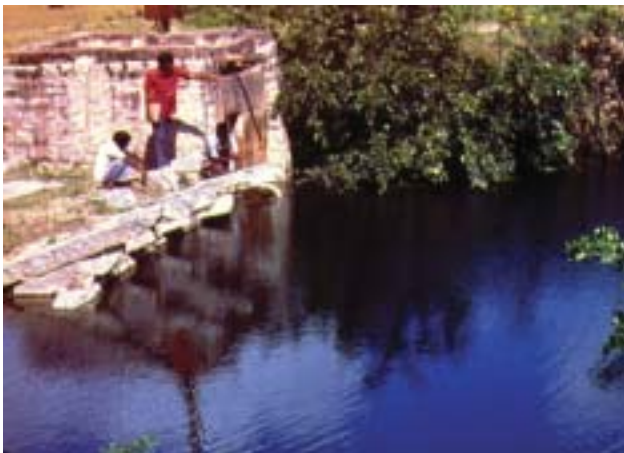
Tanks provide services to the community that go beyond irrigation.

For each rehabilitation option, policy makers would of course have to consider the expected output, the financial investment required, and also the possibility of unrest in excluded parts of the population, and compare the appeal of the various solutions to motivate the farmers and other stakeholders, as members of Water Users' Associations, to participate in tank maintenance and water management.