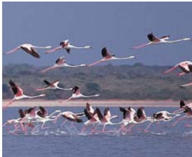
Tanks are complex socio-ecological systems that also serve nature.

This official plan is expensive. The cost of new irrigation potential at nearly US $1600/ha is high compared with the average cost of $1280 incurred in constructing new small-scale systems during the 1992-6 period. It is several times higher than costs incurred by NGO programs with people's participation in construction.