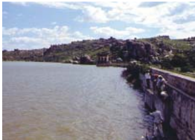
Planners assess the extent of rehabilitation required for this tank and its impact on downstream communities.

Rehabilitation of a tank should not be done before a profile of the current user base of the tank and its ecological functions is established.