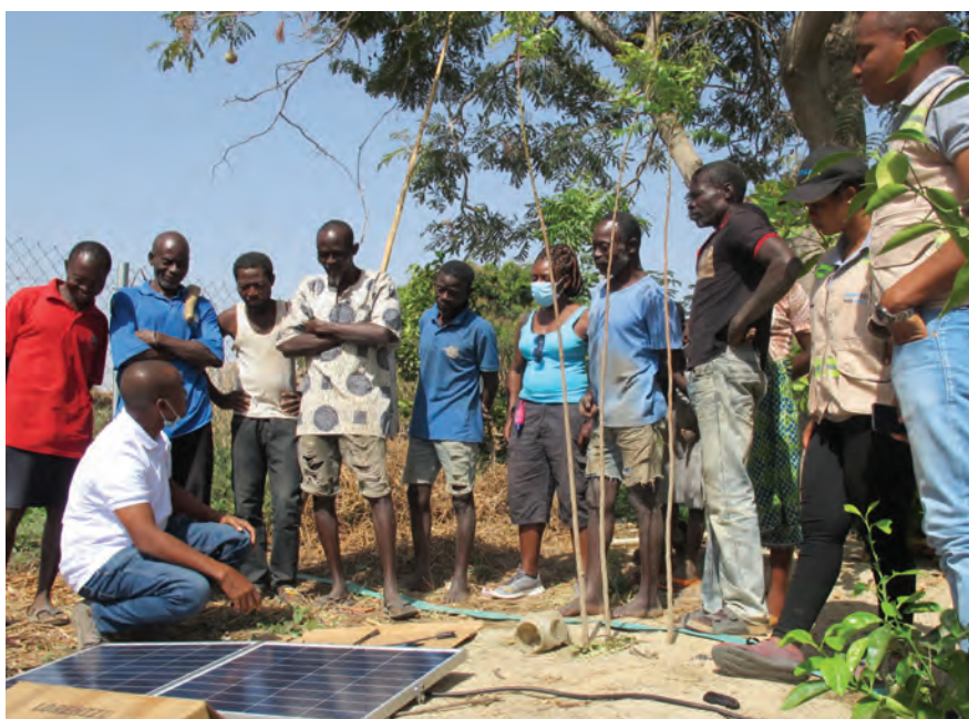
Farmers attend a Pumptech field demonstration in Bawku, Ghana.

In Ghana's Upper East Region, the International Water Management Institute (IWMI) worked with farmers, public and private sector actors, and other stakeholders in the irrigated vegetable value chain (IVVC) to co-identify a 'best-fit' bundle of solar-based irrigation technologies and services (Minh et al. Forthcoming). The bundle addresses many of the current barriers to solar-based, farmer-led irrigation . A scaling pathway was then co-developed and operationalized to link demand and supply along the IVVC and thereby extend the reach of the bundle throughout the Upper East Region and beyond.