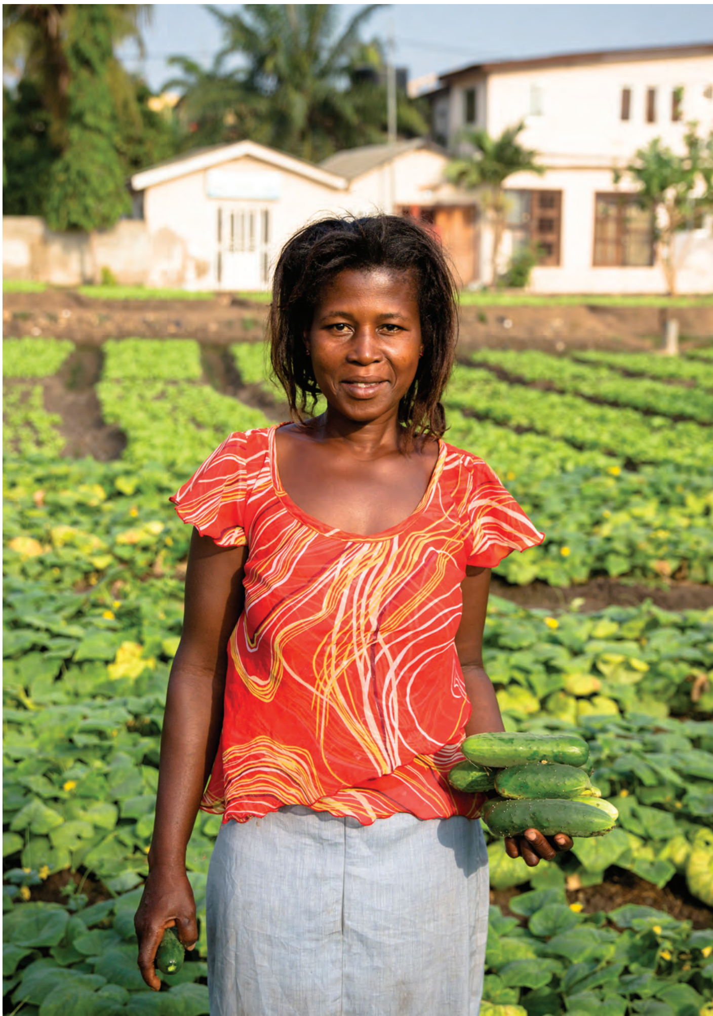
A farmer with her irrigated vegetables in Ghana.