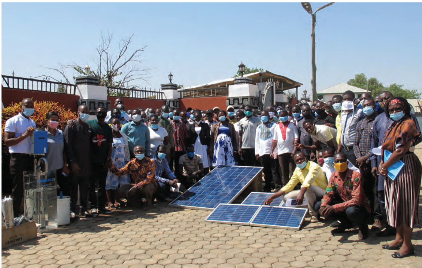
Participants in the demand-supply linkage workshop in Bolgatanga, Ghana.