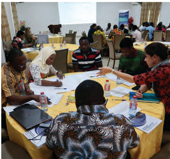
Multi-stakeholder dialogues aim to bring actors together and facilitate change.

authorities and microfinance institutions, in co-developing and scaling bundles of solutions that strengthen the adoption of PAY-OWN pumps. Facilitation also includes scaling these bundles to other regions in Ghana.