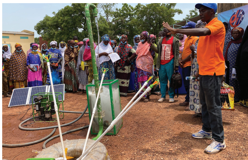
Farmers attending a field demonstration of solar-powered irrigation equipment in Sikasso, Mali.

These challenges create barriers that prevent smallholders from entering or advancing within irrigated agricultural value chains, and specifically the irrigated vegetable value chain (IVVC). Women and young farmers face additional gender, labor and market-related constraints, while also being insufficiently considered and included in agricultural and water