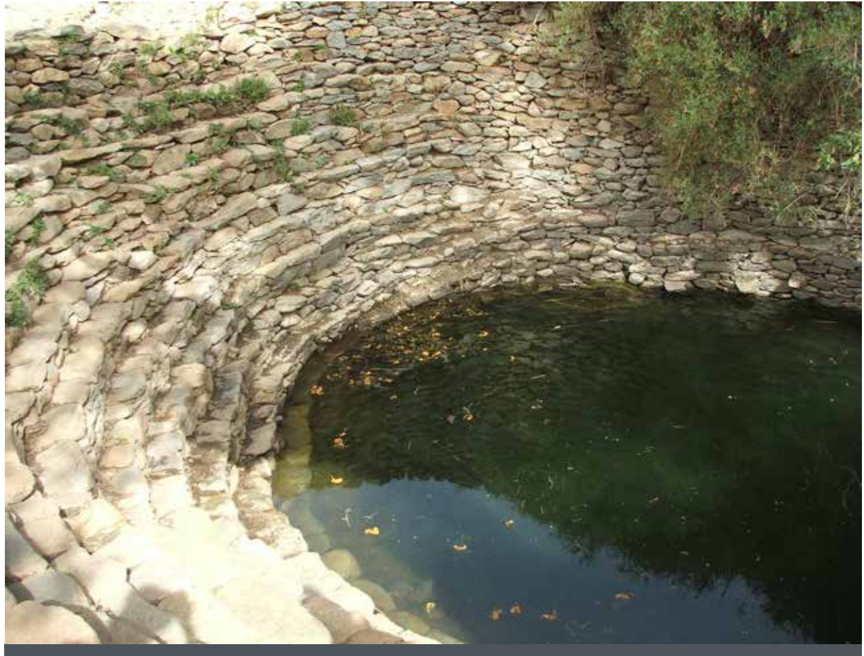
Traditional stone-lined artesian well, Ethiopia (Photo Credit: Matthew McCartney, IWMI).

Rainfall variability is an important factor in development and translates directly into a need for water storage. In Africa, and to a lesser extent Asia, existing variability and insufficient capacity to manage it, lies behind much of the prevailing poverty and food insecurity. These continents are predicted to experience the greatest negative impacts of climate change. By making water available at times when it would not normally be available, water storage can significantly increase agricultural and economic productivity and enhance the well-being of people.