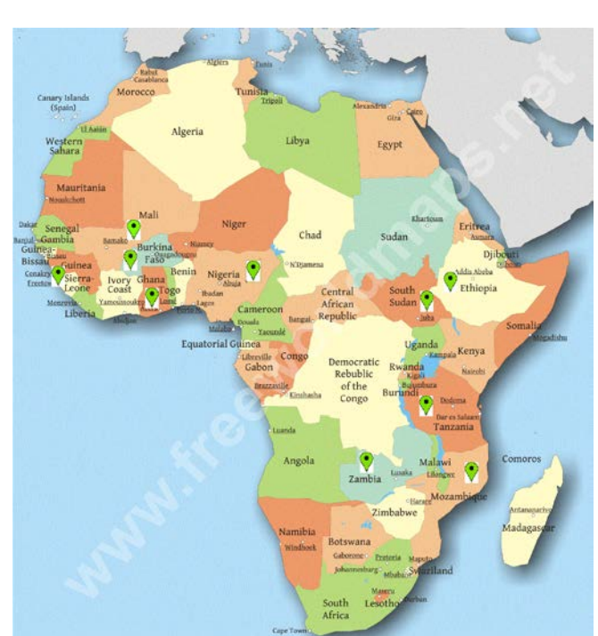
Figure 1: Countries with large scale agricultural land acquisitions greater than 100,000 ha in Africa.

The project was initiated in response to an explicit request from AMCOW for research-based policy options for managing land and water effectively and sustainably. The project aims to support informed decision-making by providing recommendations on leasing agricultural land that will ensure equitable benefits to all parties – investors, current land users and affected communities. The recommendations will also seek to ensure that land and water resources are sustainably managed so as to continue to provide essential ecosystem services.