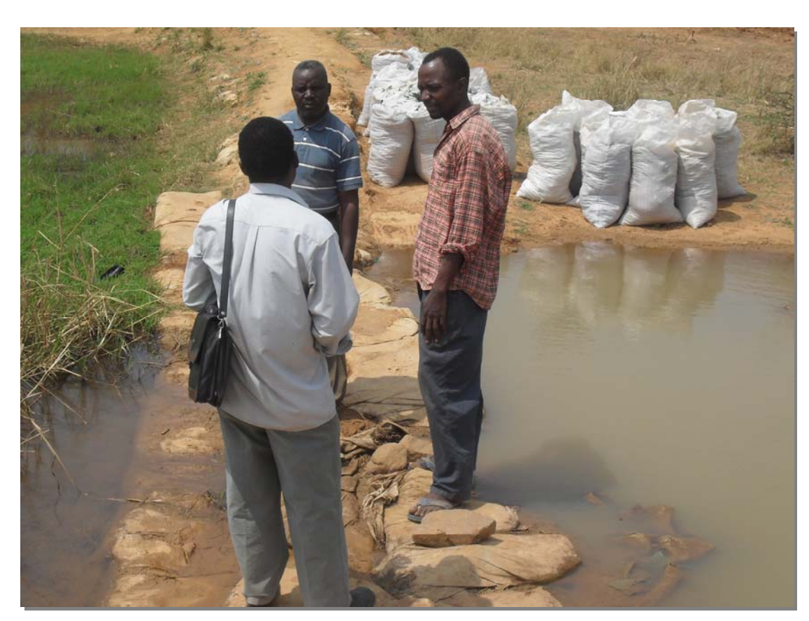
Long-term relationship with Local Government, Zambia

Indeed, all infrastructure realizations under the IWRM Demonstration projects are now in the Local governments' plans. Many already found funding possibilities and donors for follow-up activities. Proven commitment and performance counted high.