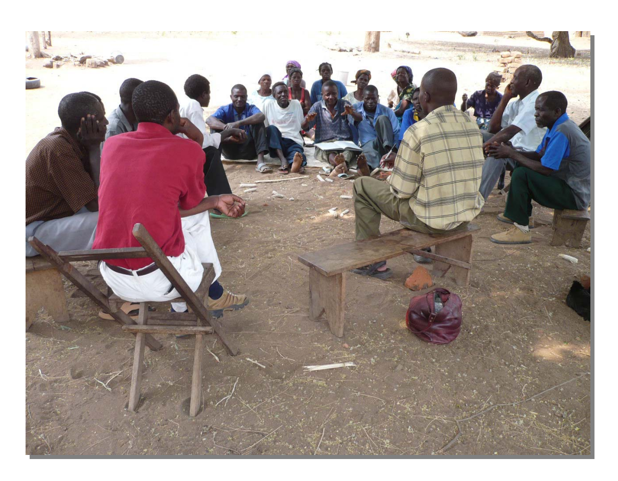
Comittee meeting, Malawi