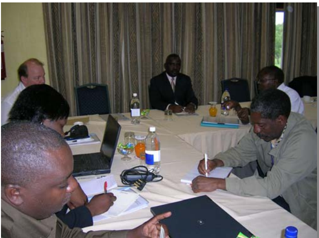
Experience Sharing Workshops