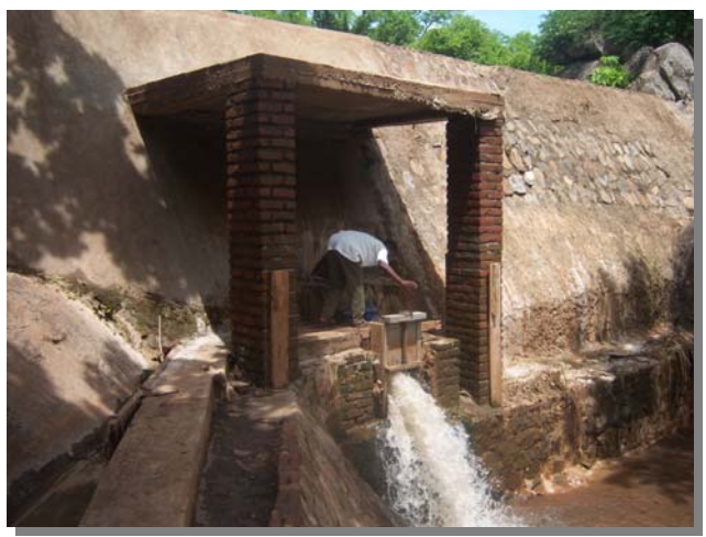
Community using water for different purposes from a multipurpose dam, Malawi