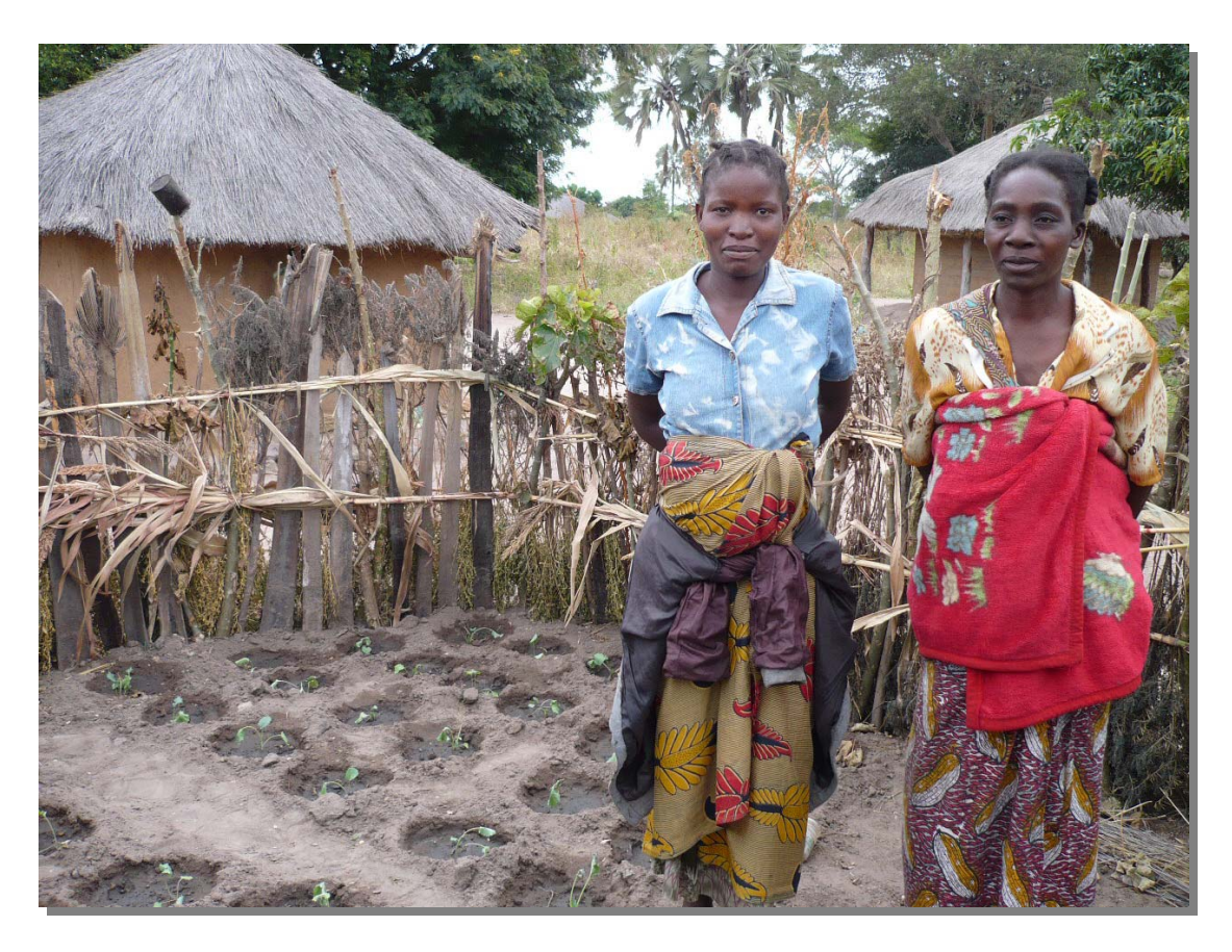
Household Vegetable Gardening, Zambia

■ Presentation of the IWRM Demonstration project in Zambia at World Water Forum 5 in Istanbul during the Topic Session on 'Multiple-use water services' organized by the global MUS Group (<a href="https://www.musgroup.net">www.musgroup.net</a>).