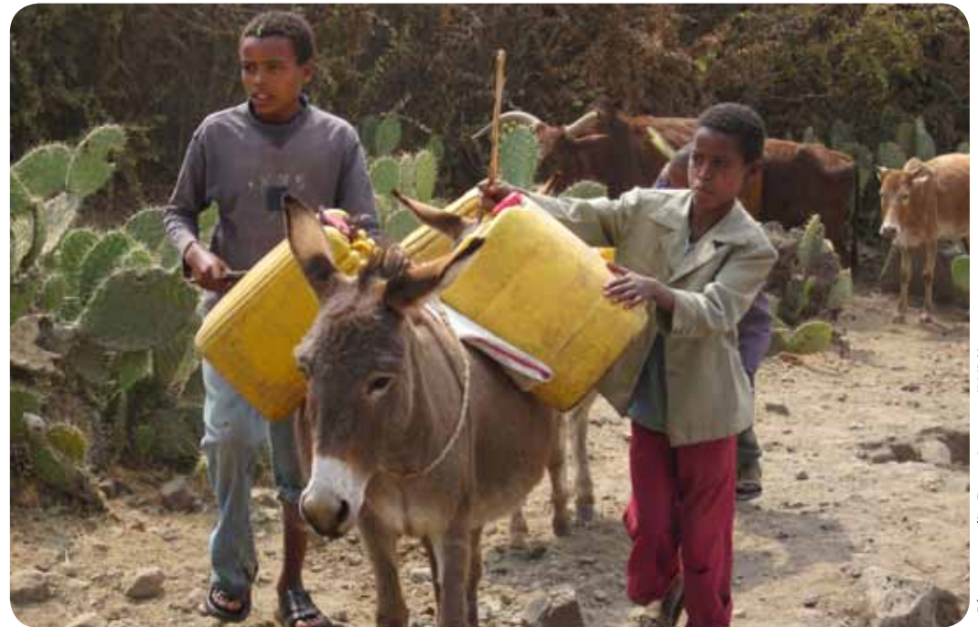
Donkeys used to transport water for domestic use.