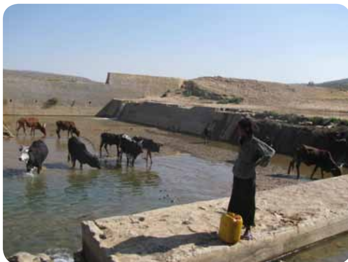
Small-scale irrigation in Laelay Agulae, Tigray.

IWMI's research in the Nile Basin is largely focused around projects in the Ethiopian Highlands, which generate 85% of downstream river flow to the Nile. To date, the greatest benefits have also tended to be reaped in the downstream countries. Changes in land and water management practices upstream can affect livelihoods along the Nile. Identifying and adopting best management practices upstream could increase the amount and quality of the water reaching downstream users.