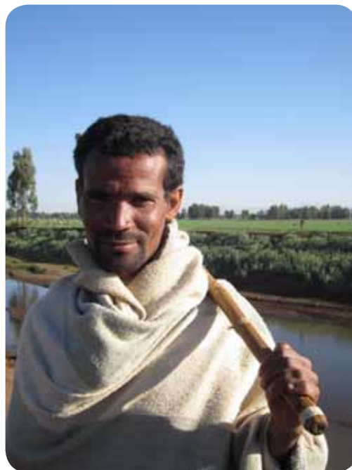
Farmer of the Blue Nile Basin.