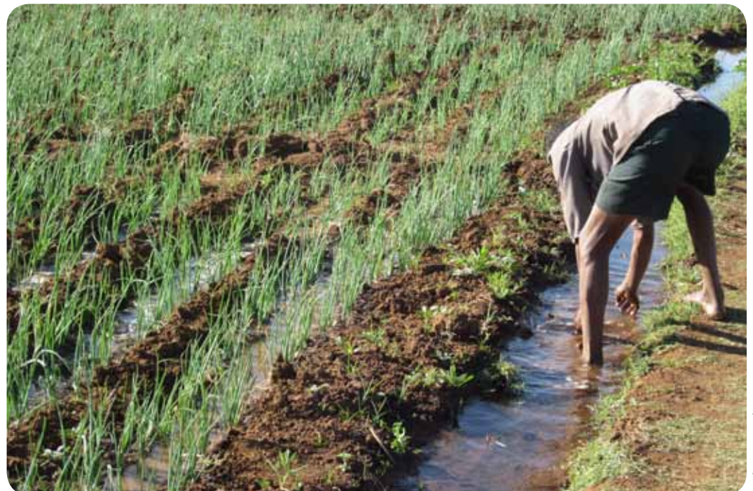
Farmer and his furrow irrigation of his shallot/spring onion crop.