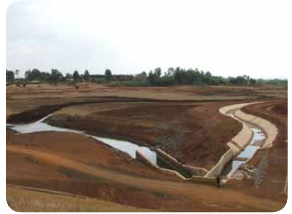
Irrigation canals at the Koga irrigation scheme, Ethiopia.

IWMI and partners are identifying the most promising AWM solutions that can be promoted and upscaled to improve food security in the Nile Basin and across East Africa. These include small- and large-scale technologies and practices to capture, store or drain water, lift and transport it, and apply it to crops in the field. An important element of this work involves designing appropriate and sustainable technologies for specific contexts, including those in which weak institutions, adverse environmental conditions, lack of infrastructure or human capacity pose additional challenges.