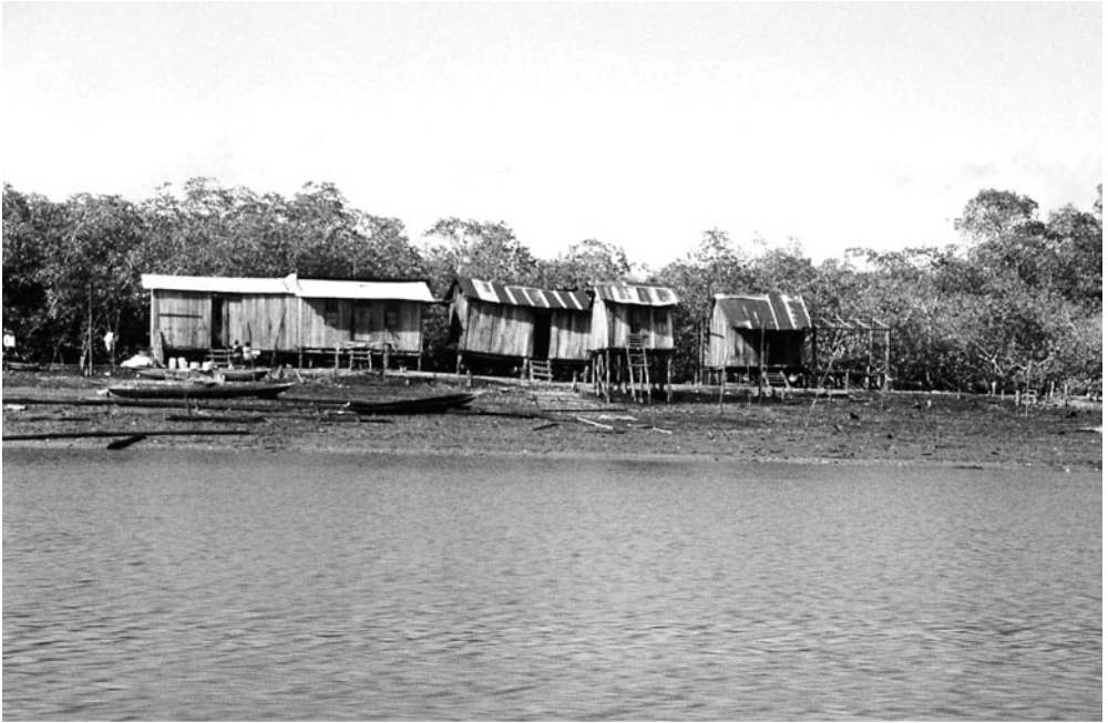
Fig. 11.3. A typical community in REMACAM.

schools and they are understaffed. Palma Real has only one secondary school. Because of this poor educational infrastructure, parents are forced to send their youngsters to urban areas for continuing education.