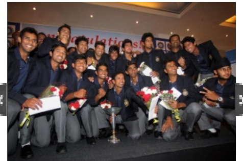
Under-19 World Cup winning team members pose for a photograph... more