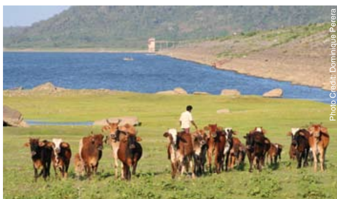
Freshwater from the Lunugamwehera agricultural scheme (pictured here) flows into the Embilikala and Malala lagoons as drainage water often carrying runoff from cattle refuse.

Because the Bundala Lagoon is not directly connected to the upstream irrigation scheme, impacts are felt less here. However, the salinity level of the Bundala lagoon is more than that of the other two lagoons due to the connection to the sea, nearby salt farms and less dilution of salt from low surface run-off and rainwater. Agricultural drainage to the Embilikala and Malala lagoons, includes dung and urine from cattle which graze on nearby lands. In addition, the breaching of the sandbar by farmers to protect upstream paddy lands results in fluctuating water levels and increased salinity. This in turn affects wading birds and other wildlife dependent on food sources in the shallow mud flats of the lagoons.