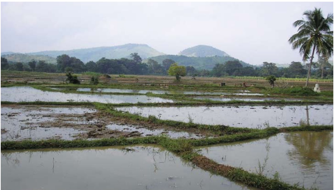
Agricultural activities such as irrigation and fertilizer application can have greater impacts on water quality.