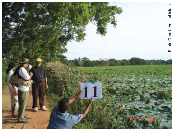
Environmental officers of the CEA working with members of IWMI's GIS lab to map wetlands in Sri Lanka.

The wetland mapping methodology was developed by IWMI's GIS Lab and as part of our training, we carried out a field survey to test and refine the methodology and to collect "ground truth" points. Simply put, this means matching the GIS satellite imagery with the ground reality in the study area. We did 5 days of this field work around the Weerawila, Tissamaharama, Debara and Yodha Tanks in the Ruhuna Basin, together with members of IWMI's GIS Lab. This paved the way for a more detailed mapping of a