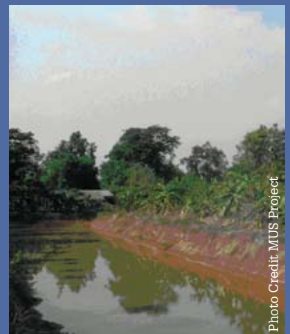
Run-on pond in Northeast Thailand