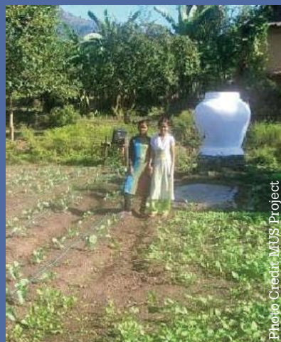
Rainwater storage tank in Nepal

The point at stake is well illustrated by farmers in Northeast Thailand. Reinforced by the economic crisis of the 1990s, a national strategy of economic sufficiency through homestead-based production was promoted in rural areas. Water was the limiting factor in Northeast Thailand. A growing network of farm leaders and farmers engaged in widespread experimentation with run-on ponds and other water harvesting structures, and integrated farming and aquaculture.