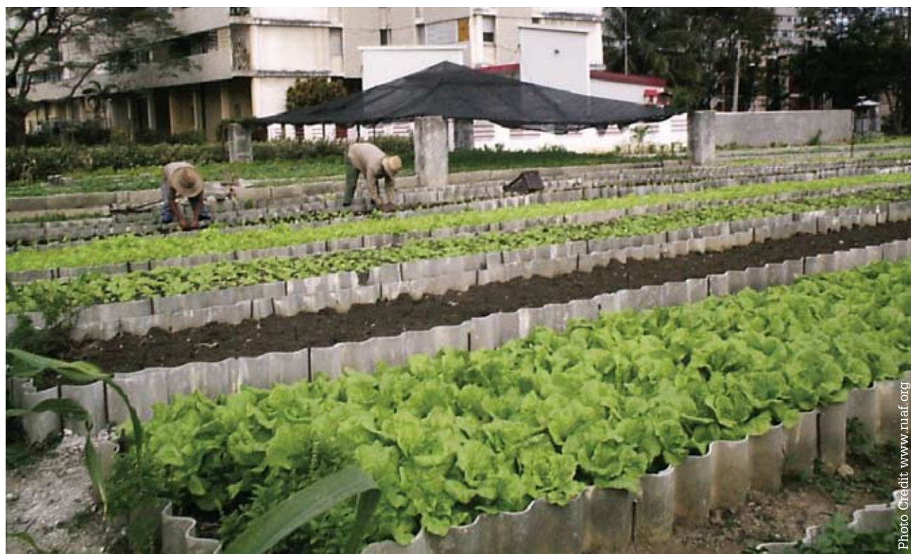
Urban agriculture in Cuba. Today urban agriculture is receiving significant interest and legitimacy in the eyes of municipalities all over the globe.

Yet, despite their growing importance, urban and peri-urban agriculture are still subject to numerous constraints, such as lack of suitable land, uncertainty about land tenure, outdated legislation, insufficient access to irrigation water of appropriate quality, inadequate know-how, and low investments. In a number of ongoing projects, IWMI and its national partners are addressing such constraints, from bylaw revision to safer irrigation practices, where irrigation water is of poor quality.