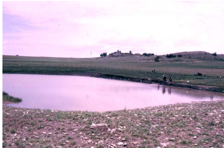
Figure 6. Finished pond at Kormargefia Peasant Association