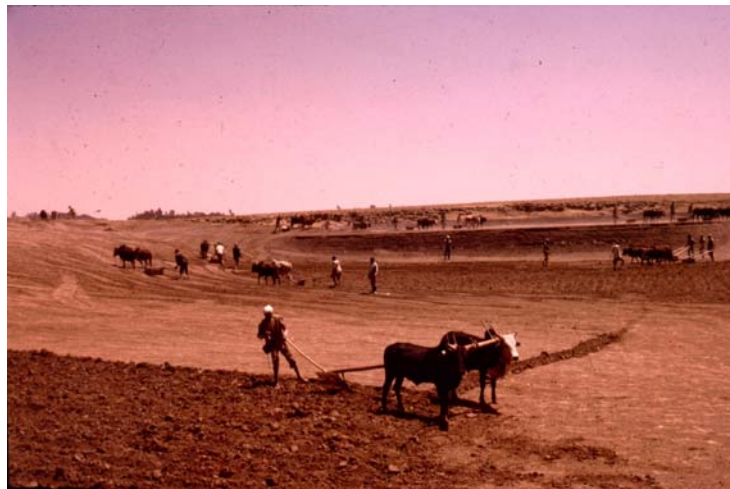
Figure 3. Loosening of the soil with the maresha with scoops working in the background

At the end of the work period in March 1985, the amount of soil excavated at Kormargefia and Faji & Bokafia sites were 9,500 m 3 and 8,700 m 3 respectively (Fig. 6). Farmers at Kormargefia site worked for 79 days on their pond in the period from December 1984 to March 1985 while farmers at Faji and Bokafia site worked a total of 76 days. The average length of a working day was 6.5 hours at Kormargefia while it 5.9 hours at Faji & Bokafia. At Kormargefia an average 3.1 oxen pairs per day were used to break the earth with a maresha prior to excavation and 15.2 oxen pairs per day were used with scoops for excavation. The corresponding numbers at Faji & Bokafia were 2.8 and 13.7 respectively. The net excavation rate per oxen pair per day, including oxen involved in both ploughing and scooping was 6.6 m 3 at Kormargefia and 7.0 m 3 at Faji & Bokafia (Anderson and Asatke, 1985). The oxen used at both sites were in good condition throughout the working period. All farmers were also able to handle the scoops properly by the end of their first working day. A few breakages of scoop handles occurred during the first week of work while the oxen were being trained. The broken handles were replaced by the farmers.