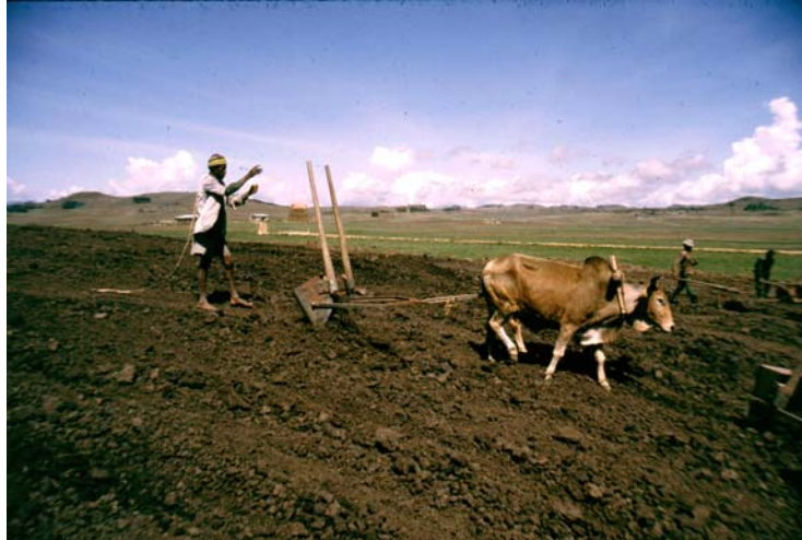
Figure 5. Dumping of soil from scoop