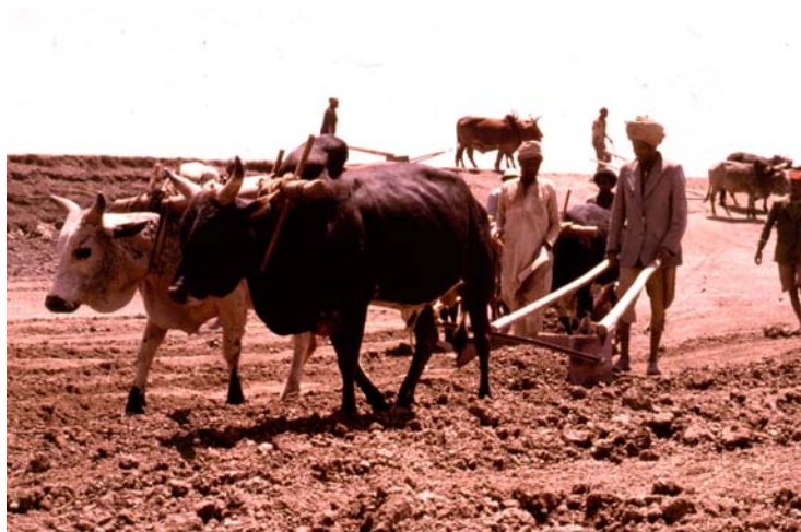
Figure 4. Group of farmers working on pond excavation